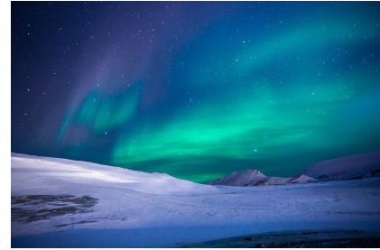
Aurora Borealis

Tonight is finally your chance to experience one of the most mystifying phenomena the earth has to offer: the Aurora Borealis. A week ago you begged your parents to let you go out to the countryside this evening, and luckily they gave you the green light. You put on warm clothes, fill your flask with hot coffee, and prepare a quick snack. It seems like conditions are perfect; there is only a single cloud on the horizon and you look forward to the beautiful prismatic display.